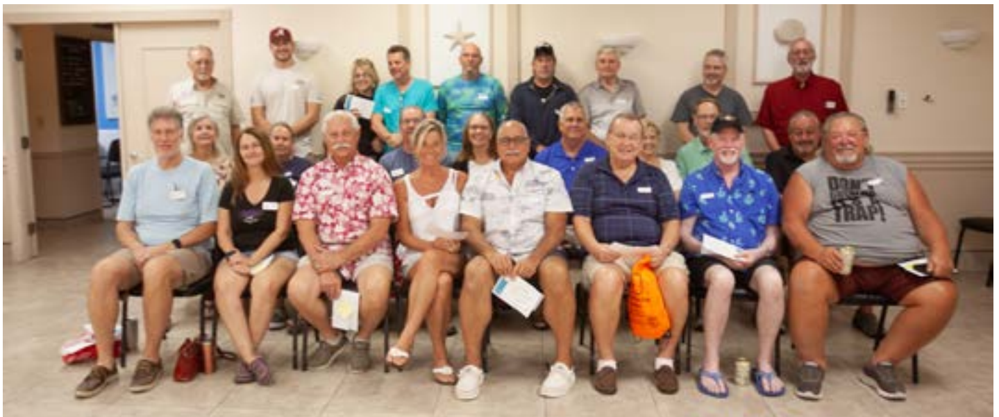
ABC Grads 10/25/23