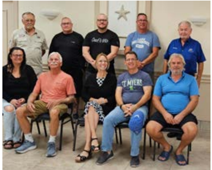
ABC Grads 9/27/23