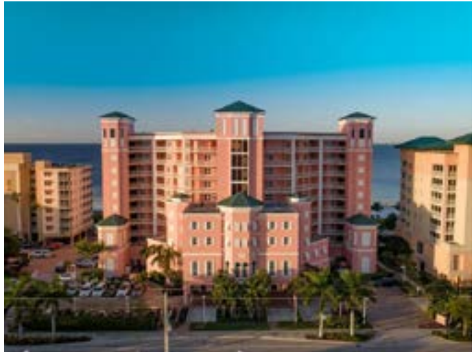
Pink Shell Resort, Fort Myers Beach