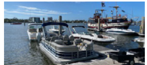
Weekenders - 31 club members in 7 boats went to Parrot Key at Ft. Myers Beach January 27, 2024