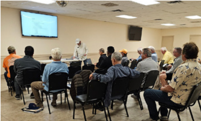
Co-op Charting group meets 7:00 p.m. the first Monday of the month at the Power Squadron