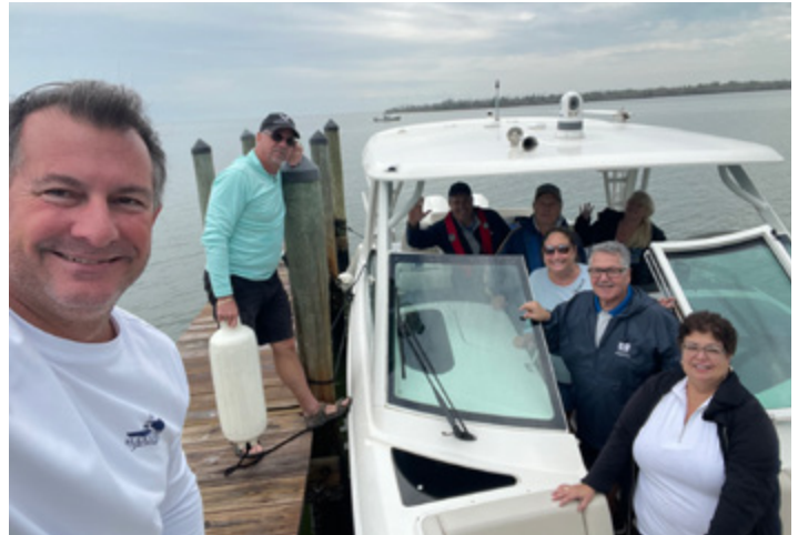
Despite the weather, our Cooperative Charting Group managed to accomplish a successful run. Thank you to all the people who participated!