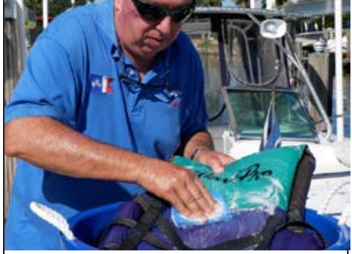
America's Boating Channel™

Promoting National Safe Boating by Debra Allen, AP