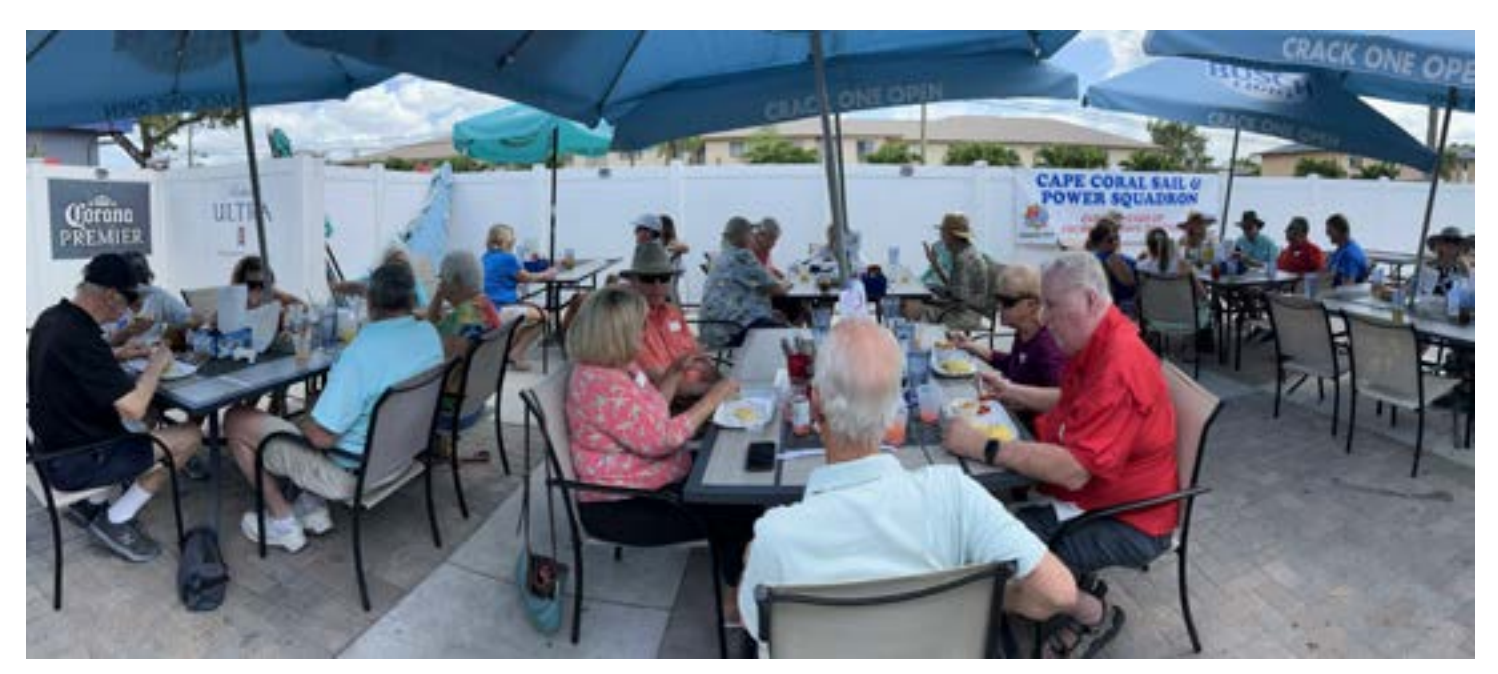
38 CCSAPS members attended the Sunday Social on May 7, 2023