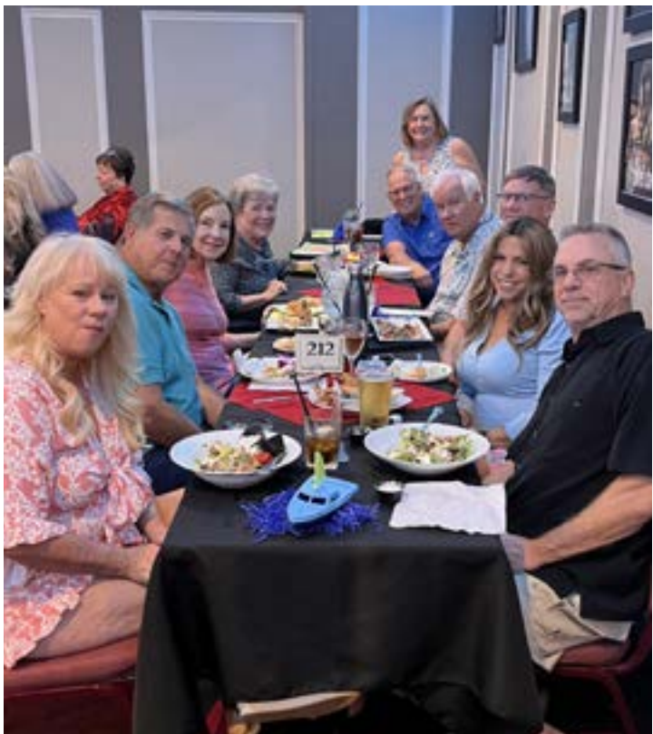
Ten Squadron members had a blast at the SingoBingo event at the Cape Cabaret in Cape Coral on September 21.

https://ccsaps.ticketleap.com/wine--knots23/