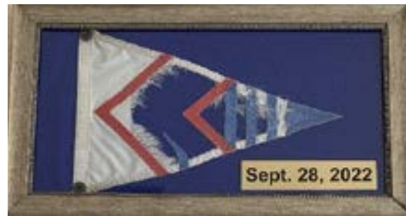
The burgee that survived Ian

The word "burgee" possibly originates from French dialect meaning "ship owner". It is usually a triangular or swallow-tailed flag flown from the mast of a merchant ship for ownership identification or from the mast of a yacht to indicate the owners' membership in a particular yacht club. Powerboats fly the burgee from the bow while most sail boats fly them from the starboard spreader.