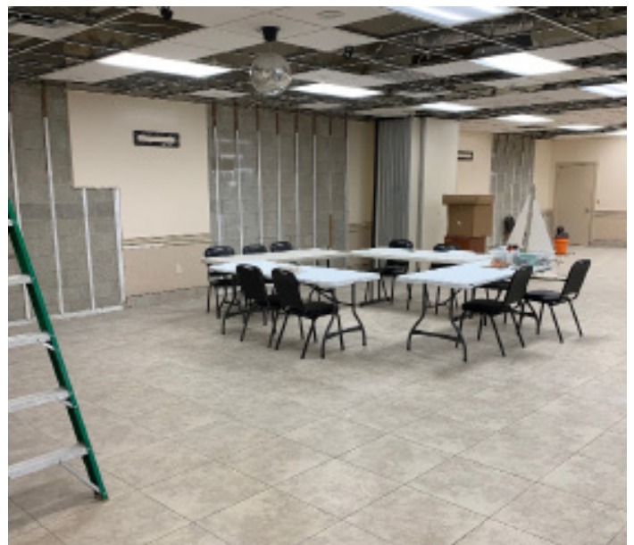
Updated photos of the interior of Squadron Harbor.